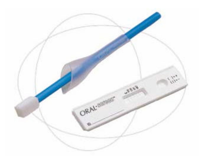
Figure 5: Picture of the ORALscreen<sup>TM</sup>

The ORALscreen is a relatively simple on-site instrument for saliva screening. It is packaged as a three (opiates, cocaine, cannabis) or four panel (opiates, cocaine, cannabis, methamphetamine/MDMA) device.