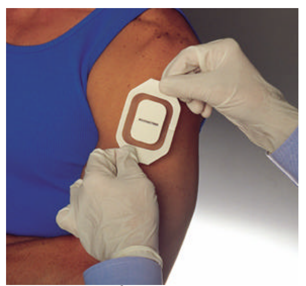
Figure 6: Picture of the PharmChek Ô Sweat Patch

The PharmChek<sup>TM</sup> Sweat Patch is worn on the outer portion of the upper-arm or back, after the skin has been cleaned with an isopropyl alcohol swab. It consists of an adhesive layer on a thin transparent film of semi-permeable surgical dressing to which a special absorbent pad 14cm<sup>2</sup> is attached. The patch can be worn for between 1-14 days. During patch wear, non-volatile substances cannot penetrate the outer film yet water, carbon dioxide and oxygen can pass freely leaving the skin underneath healthy. Periods of wear of (usually) 7 days are reported to be tolerated well (Cone, Hillsgrove, Jenkins, et al., 1994; Taylor, Watson, Tames, et al., 1998) with some cases of mild irritation or swelling. Over the period of wear sweat saturates the pad. At least 300 µL of insensible sweat is collected per day. Sweat solutes are thus concentrated in the device while the aqueous component evaporates. The device is designed so that attempts to remove it prematurely or tamper with it are readily visible and each pad displays a unique serial number. It has been approved by the Federal Drugs Administration in the United States for the detection of drugs in sweat.