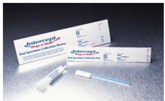
Figure 4: Picture of the Intercept<sup>TM</sup> Oral Fluid Collection Device

Intercept<sup>TM</sup> is a laboratory based oral fluid (saliva) drug test. It is the only saliva test which has been cleared by the US Federal Drugs Administration for the detection of marijuana, opiates, cocaine and amphetamines. It is sold as a package that includes appropriate screening and confirmatory testing at Lab One Inc.