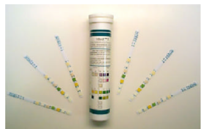
Figure 7: Picture of the Intect<sup>™</sup> 7 container and strips.

The Intect<sup>TM</sup> 7 urine adulteration test strip is a plastic strip affixed with 7 chemically treated pads for assessing the integrity of the urine sample prior to testing. By visual color examination of the pads after dipping the strip into the urine sample, semiquantitative values of creatinine, nitrite, glutaraldehyde, Ph, specific gravity, bleach and pyridinium chlorochromate can be determined.