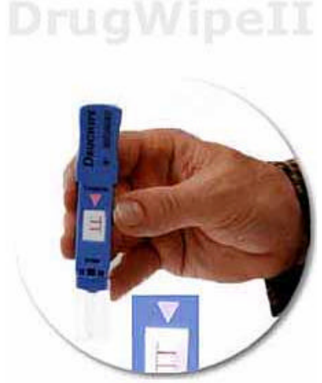
Figure 7: Picture of the Drugwipe II.

The Drugwipe II is a device suitable for detecting drugs of abuse in or on other substances. It can be used to identify pills or powders as drugs, it can be applied to objects do detect drug traces or it can be applied to the tongue or skin as a way of identifying drug traces in saliva or sweat. It is important to note that this device alone can never discriminate drug use from drug exposure or environmental contamination.