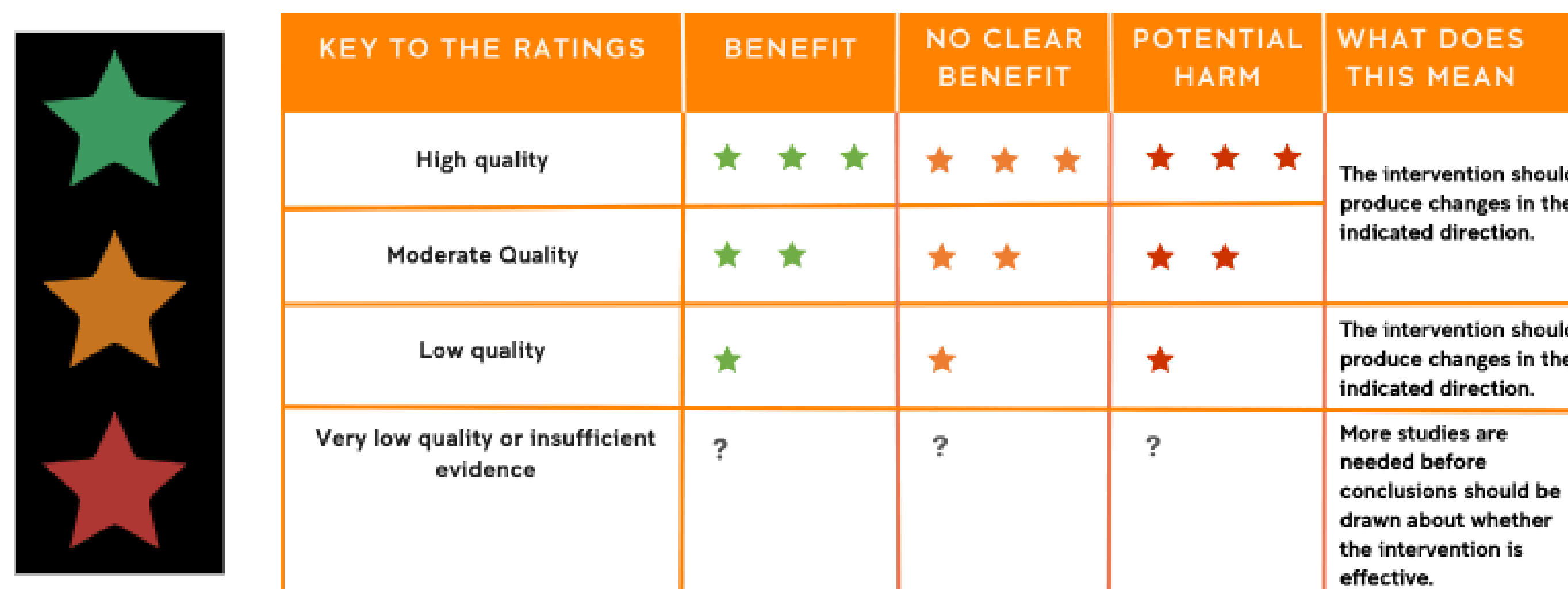
Table 2. Interventions with moderate or high-quality evidence.