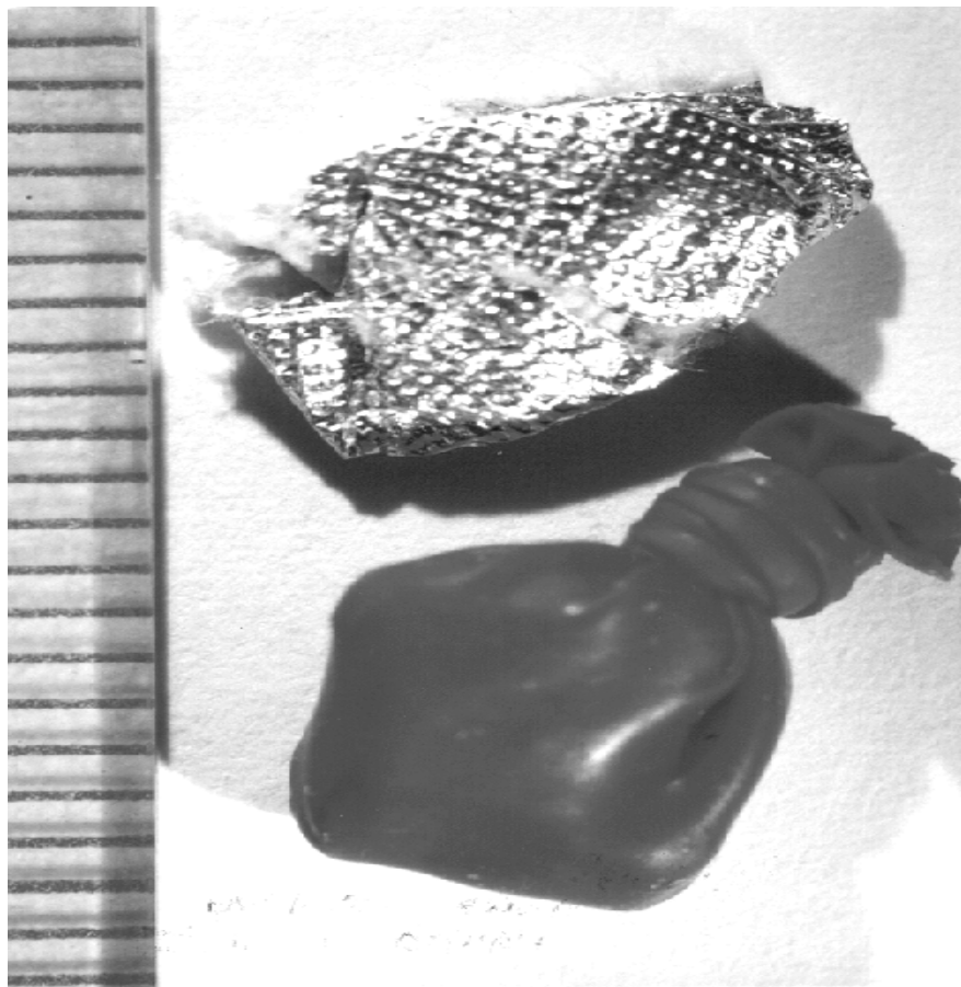
Figure 1: Contents of exhibit 32, comprising one balloon (a “cap”) and one foil (scale: 1 division=1mm).