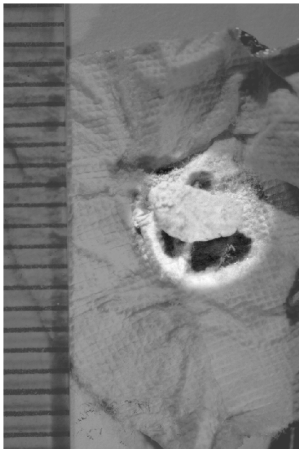
Figure 2: Heroin contained in exhibit 32, comprising off-white/beige solid (highlighted).