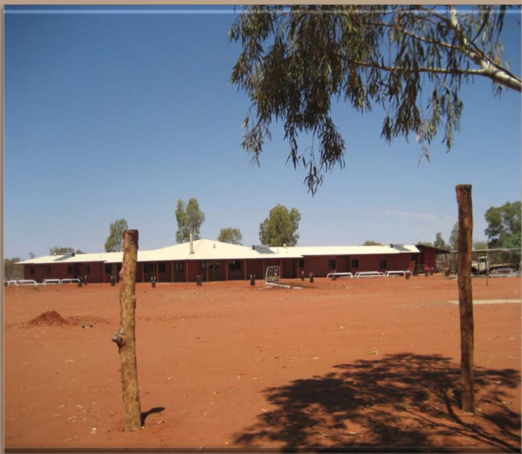
Ilpurla Outstation, approximately 260 kilometres from Alice Springs

Five weeks were spent on observation. This included observation in town camps, remote communities, and agency board meetings.