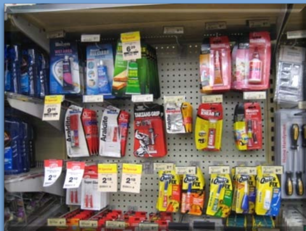
Volatile Substances in an Alice Springs supermarket

•In Alice Springs there are four main programs set up to respond to volatile substance misuse: