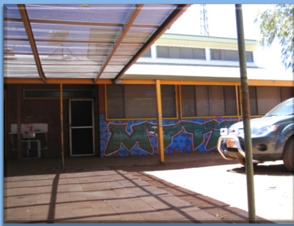
Mt Theo program head office at Yuendumu, 2008

b) Jaru Pirrjirdi ('Strong Voices') located in Yuendumu